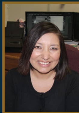
Designer: Crystal Reese